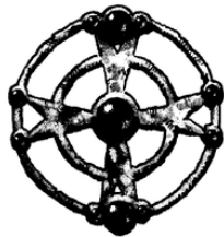
Symbol of St. Cuthbert

As spring's golden trumpet heralds the arrival of Easter, and the dark night of Lent passes, so, like Cuthbert, bright star of the North, may we become your Easter people, O Christ, shepherds of your sheep, peacemakers and hospitality givers, open to change and partnership, led by the Spirit, in solitude and in service. Amen.