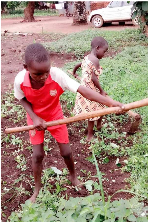
Children taking part in cultivating in Maridi.

The meetings and prayers about Nodding Syndrome are bearing fruit. There is a Nodding Syndrome Alliance with a specialist clinic being run from the hospital. There are outreach workers taking information out to the furthest reaches of the state. The organisers do not yet see a need for a centre and would prefer our help in sourcing meds only at the moment. If anyone feels called to help with that please send me a private email. We praise God for answering our prayers and ask him to provide more food and medicine.