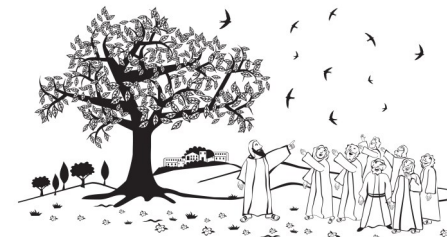
Look at the birds of the air; they neither sow nor reap . . . and yet your heavenly Father feeds them. (Matthew 6:26)