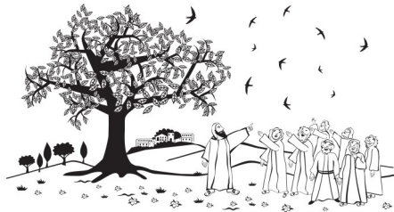
Look at the birds of the air; they neither sow nor reap . . . and yet your heavenly Father feeds them. (Matthew 6:26)